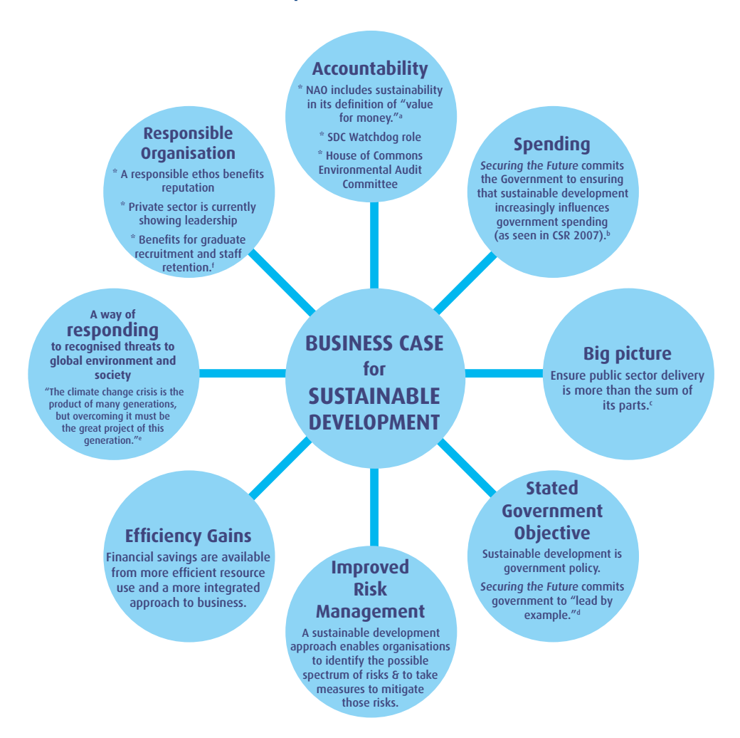
Figure 4 The Business Case for Sustainable Development

In preparing the business case, engaging the necessary stakeholders in its development from the earliest stages will help create buy-in and support. Bringing together the right people to set priorities and make key decisions will increase the probability of success. As sustainable development is a whole organisation approach, a lack of engagement across staff and associated departments or bodies risks failure through fragmentation. For further