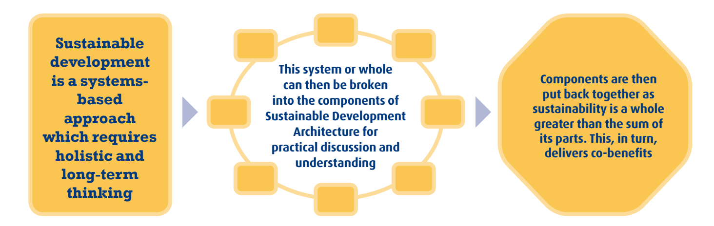
Figure 2 Understanding the Sustainable Development Approach

Getting the right high-level plans in place to leverage change is essential for sustainable development to be properly embedded in any organisation, but so too is a 'bottom up' approach to particular topics or cross-cutting issues. This guide offers advice on how to do both 'top down' and 'bottom up'. It describes how the principles of sustainable development can be embedded in the overall 'architecture' of Government; focuses on specific aspects of that architecture and the structures and processes around them – with practical guidance for practitioners; and, finally, provides an overview of how all these structures and activities can be integrated into a genuinely holistic approach. This is outlined in Figure 2.