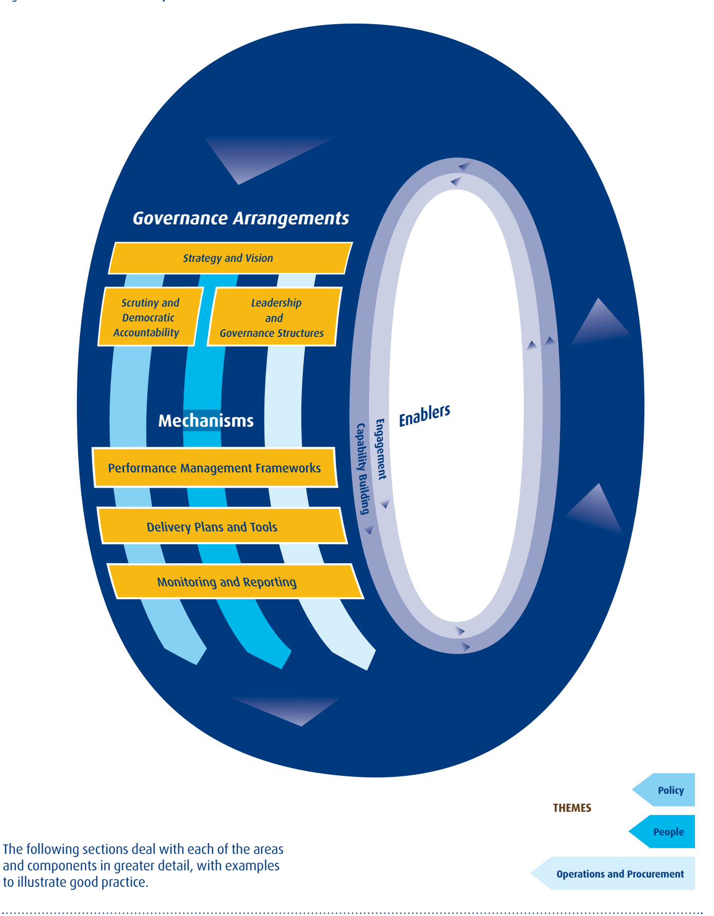
Figure 6 Sustainable Development Architecture