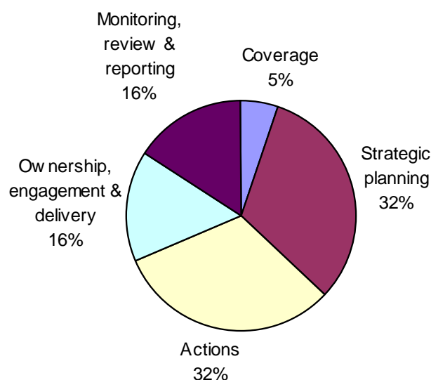
Figure 2: Distribution of points by theme for 19 questions (where question 2 is not applicable).