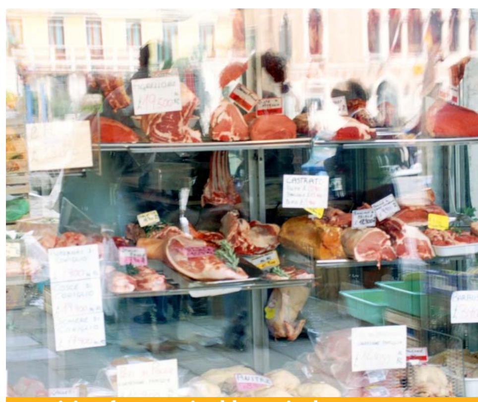
a vision for sustainable agriculture submission to the policy commission on the future of farming and food